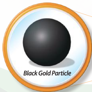
Differentiated Black Gold Conjugate Technology